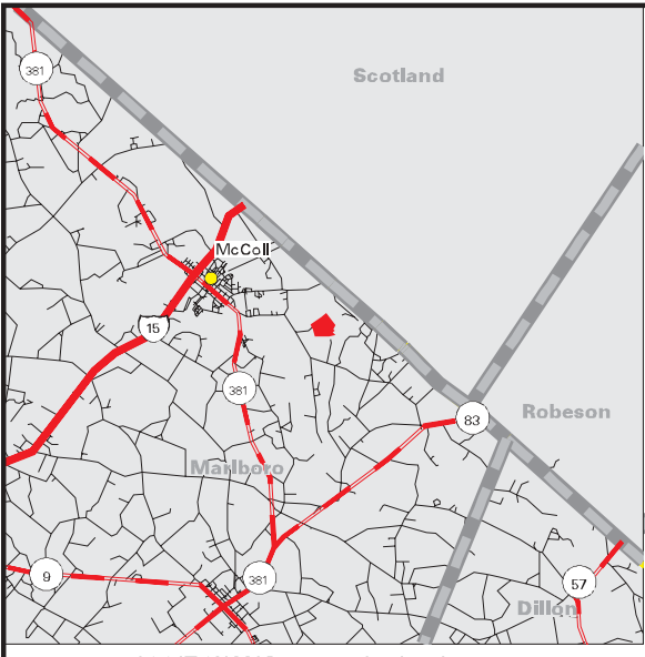
LOCATION MAP scale 1 inch = 4 miles