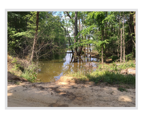
Acreage 26.52 +/- acres