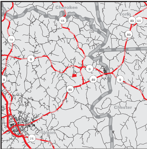
LOCATION MAP scale 1 inch = 5 miles